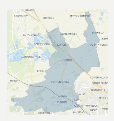
Cricklade & Purton