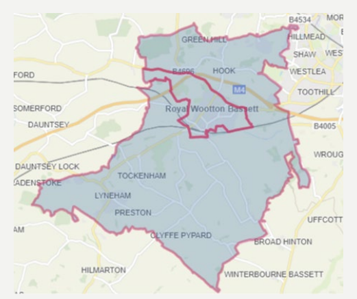
Royal Wootton Bassett